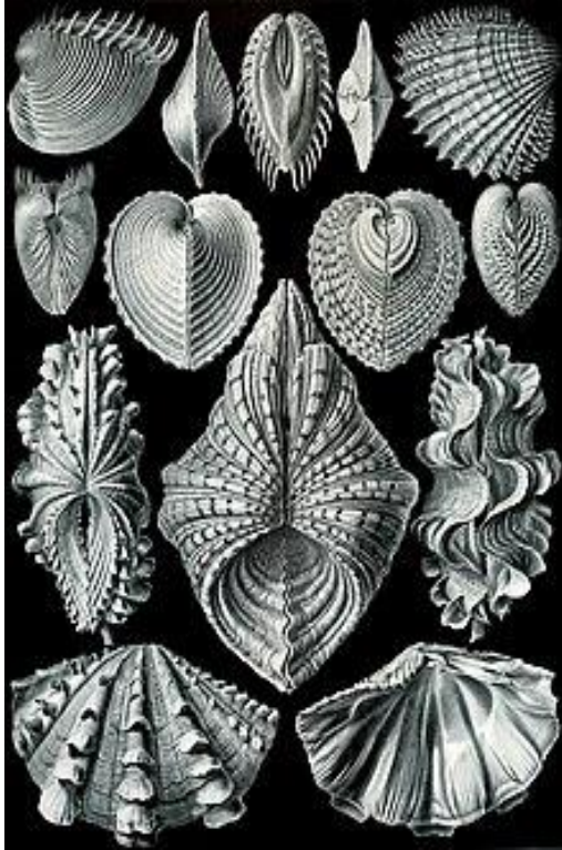
“Acephala,” from Ernst Haeckel's Kunstformen der Natur (1904)

shell in which it is encased and thus cannot apprehend the immanence of God. However, to bemoan the shell of an oyster as the impediment to its viewing of a distant heaven—and, by the analogy’s logic, to critique human intellect as the barrier to faith in God—is to neglect a vast world of divine meaning-making and relation-forming enacted by and through the oyster’s shell. Though the average beachcomber may encounter the husky remains of these bivalves as they wash up along the shoreline along with other detritus or plastic waste, oysters’ diptych-like shells constitute a vibrant entanglement of organic and inorganic matter existing