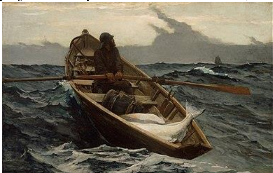
The Fog Warning by Winslow Homer (1885)

differently perhaps, with the callouses, wounds, and weather-worn experiences of our most recent voyages through thick water—before