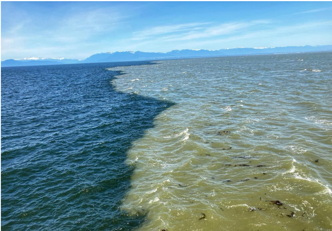
Brackish water where the Columbia River meets the Pacific Ocean near Vancouver

In learning from and listening to the participants in this year's Humanities and Belief workshop, I've come to understand the call I've received to pursue and sustain a life as a scholar