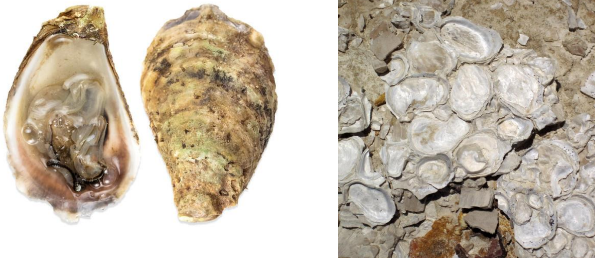
Left: Atlantic Oysters, Right, fossilized oyster shells encrusted onto each other

the shell's rim, steadily expanding its size. Thus, these creatures' shells grow as they encrust more and more matter around and onto themselves. In fact, similar to trees, marine biologists can discern the age of a given bivalve by measuring any visible concentric rings formed on the exterior of its shell. To me, this raises a spiritually instructive question about what oysters "are" both biologically and ontologically. If the main mass of an oyster's "body" is culled together via an encrusting of other matter, proteins, and substances onto itself, are not oysters always and essentially "more-than-oysters?" It is this state of being and living as constitutively "more-than-themselves" that I find so deeply spiritual about oysters. Their lives are witnesses to the miraculous re-conception of life and its meanings enabled by Christ's redemption and resurrection, an event that, as Matthew Wickman beautifully describes it, helps us see that "we are only ourselves because we are not ourselves only . . . that our singular lives become multiple, raised to more glorious and ultimately resurrected versions of themselves" thanks to Christ. 3